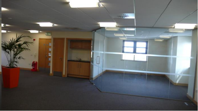
Upper Floor Office