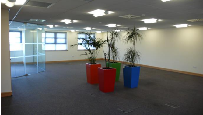
Upper Floor Office